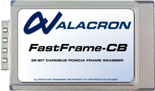
Alacron's FF-CB Cardbus form-factor frame grabber for laptops

Recently, notebook computers are increasing becoming more portable, powerful and able to compete with desktop units as the main computer for a wide range of application. Using this power and the Cardbus and Express Card (both 34mm and 54 mm) standards which allow third party interfaces to the new generation of notebook computers has led to the increasing feasibility of using laptops in machine vision applications. These trends have motivated Alacron, Inc., to produce a complete line of both Cardbus and Express Card frame grabbers that interface to camera link, digital and analog cameras to notebook computers. These products are shown below.