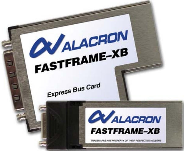
Alacron's 54mm and 34 mm FF-XB Express Card format notebook frame grabbers